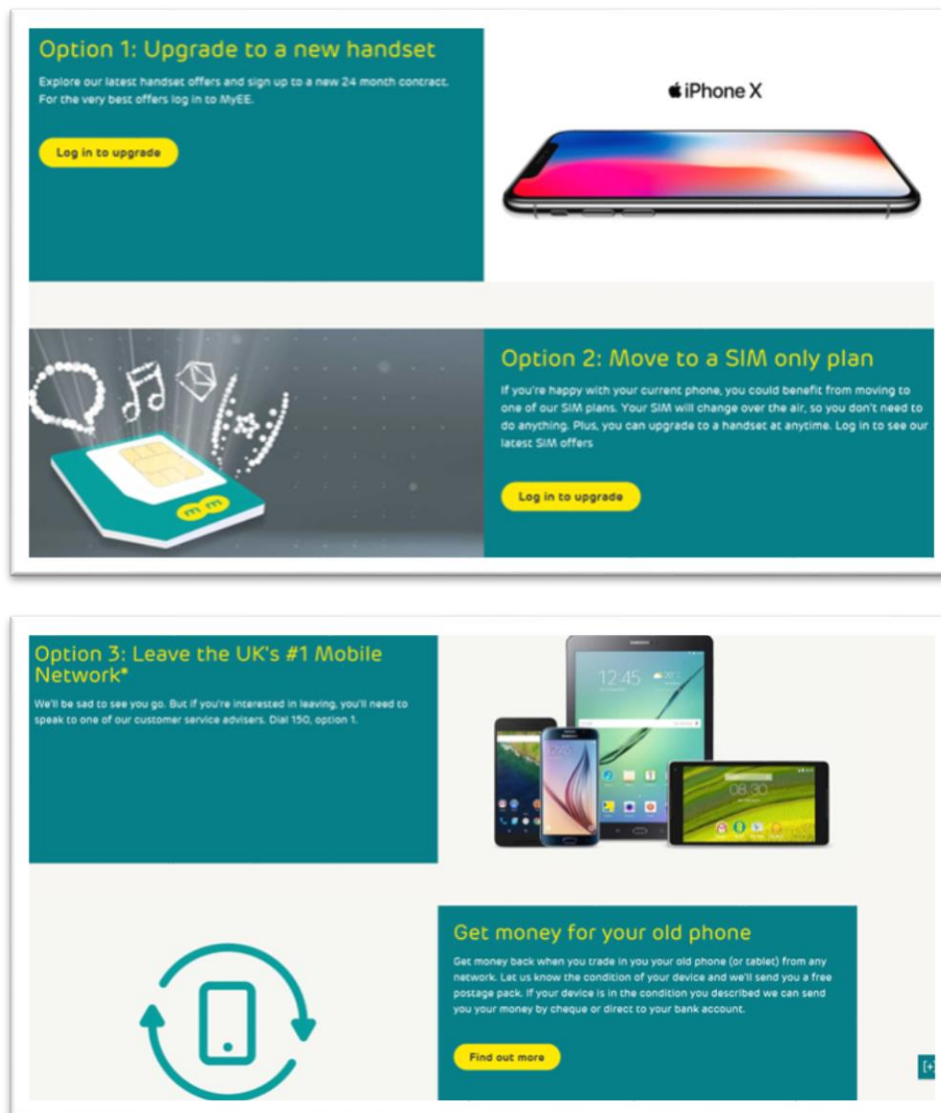
Fig 3: Our static webpage clearly sets out customers options when they come to the end of their contract.

7.3. In Plusnet, over [X]of the Plusnet Mobile base are on a 30-day rolling contract with the ability to change tariff at any point in their contract, either through calling us or through 'My Account'. [X]