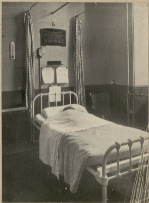
No. 6 HOPE WARD