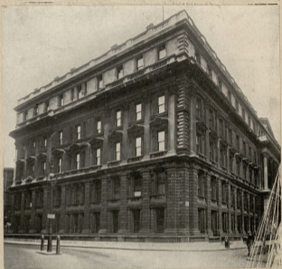
CENTRAL TELEGRAPH OFFICE · LONDON